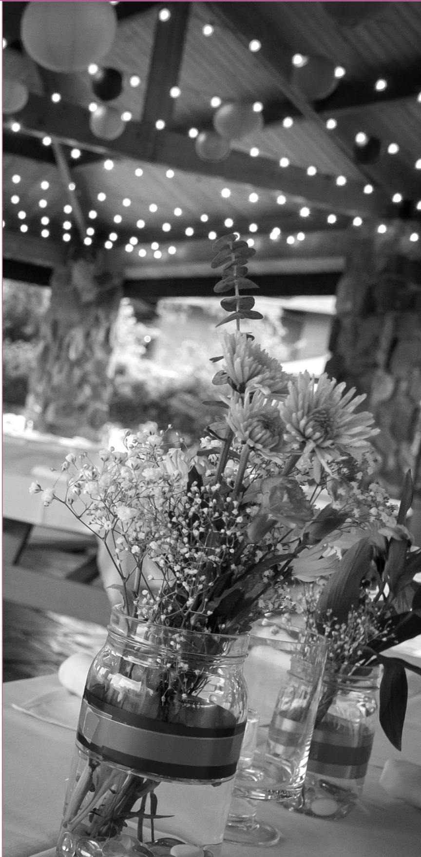
Emily Dunn Photo